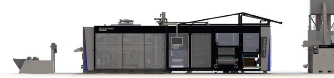
Film unwinding station KA 83