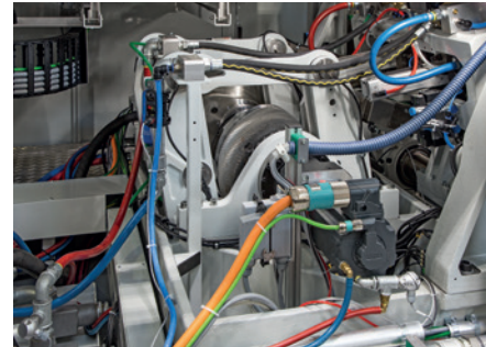
Forming station KTR 5.2 Speed Strong & smooth drive – low vibration