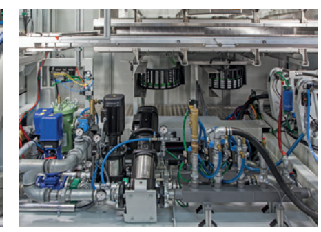
New innovations for your success – Powerful cooling system, fully automated