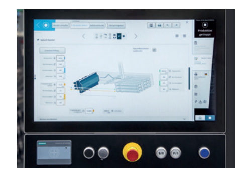
State of the art: KMI 2.0 For modern manpower & machine

Intuitive, user-friendly and easy to use for modern manpower, machine and automation