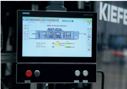
Smart setting, maximising production uptime