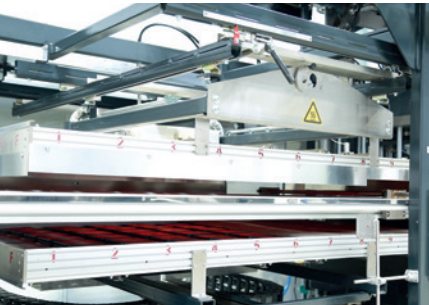
Efficient heating, high quality products