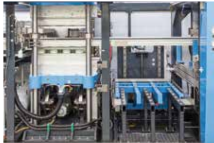
Tool-changing station for quick tool-change in one block