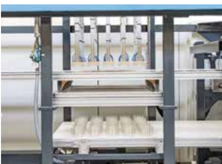
Reliable stacking, high availability of the machine