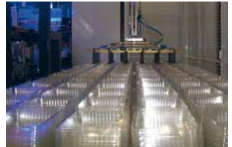
Pick & Place to opposite operator side, convenient height of reception