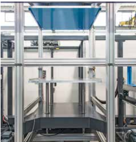
Slug-removal station (e.g. Euro-holes)