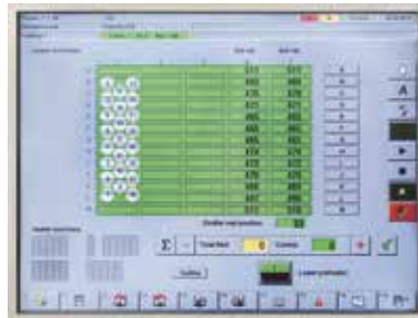
Advanced heater settings