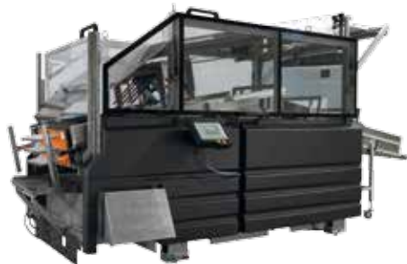
PUS Pick-up Stacker Semi-Automatic

Thermoforming machine, tooling and automation for downstream out of one hand