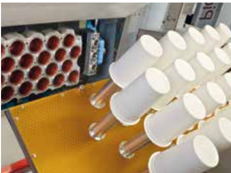
Optimal für dünnwandige Becher