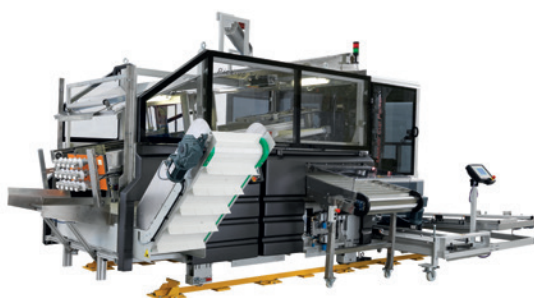
PUS Pick-up Stacker Compact

Thermoforming machine, tooling and automation for downstream out of one hand