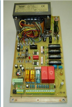
ESA 17-3 new