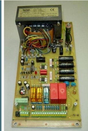
ESA 17-3 new